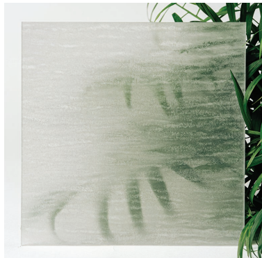
Velvet Varia A durable, blurred finish with a crushed velvet pattern that runs parallel to the width of the panel.