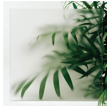
Patina Varia A non-glare finish with a smooth appearance.