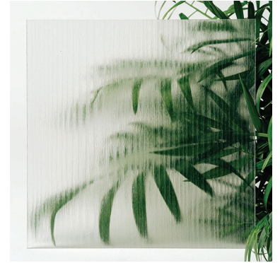
Grain Varia A translucent wood grain pattern that runs parallel to the length of the panel.