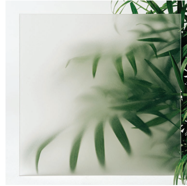
Vellum Varia, Chroma, Koda XT A durable brushed matte finish that adds a subtle texture to our materials.