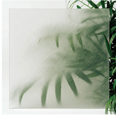
Grid Varia Fine, horizontal crosshatched lines create a robust texture.