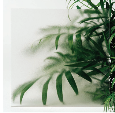
Sandstone Varia, Koda XT A subtle diffusion effect with light texture and durability.