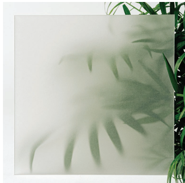
Supermatte Varia A frosted matte finish that assists in light diffusion.