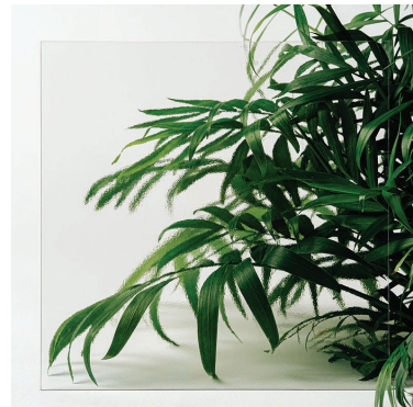
Patent Varia, Koda XT A high gloss finish with the highest light transmittance available; with an antique glass effect.