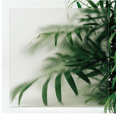
Stucco Varia, Koda XT A durable finish with pebbled texture.

A collection of finishes designed to enhance the appearance and performance of 3form® materials. In most cases finishes will be applied to the front and back surfaces of a material.